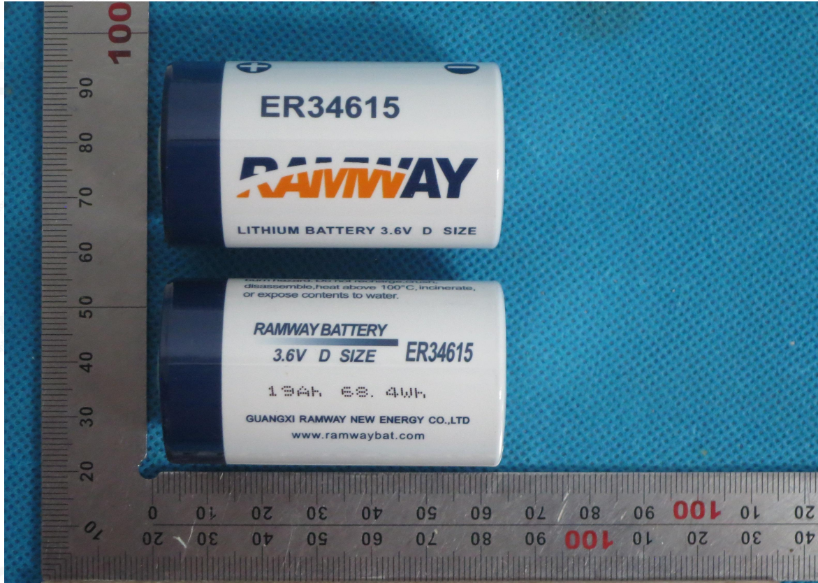
鑫宇环仅对原报告照片中的样品负责 AGC authenticate the photo on original report only

The results shown in this test report refer only to the sample(s) tested unless otherwise stated and the sample(s) are retained for 30 days only. The document is issued by AGC, this document cannot be reproduced except in full with our prior written permission. The document is available on request and the brief information for its validation can be assessed and confirmed at http://www.agc-cert.com