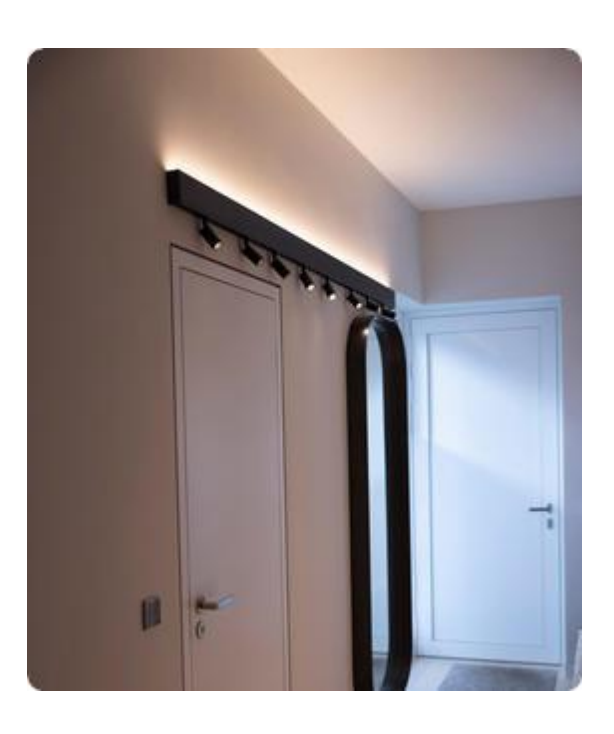
Illustrations may only be similar and serve as an orientation.

Matric-WX. LED. Wall mounted luminaire. Luminaire body made of high-quality aluminum profile. Surface finish Silver Anodised. Direct/indirect light distribution. Colour temperatur3000K (Warm White). Colour Rendering Index (CRI): >80. Asymmetrical optics for homogeneous illumination extending into the depth of the room. Switchable. LxWxH (rectangular). L=1478mm. W=41mm. H=100mm. High-power current.