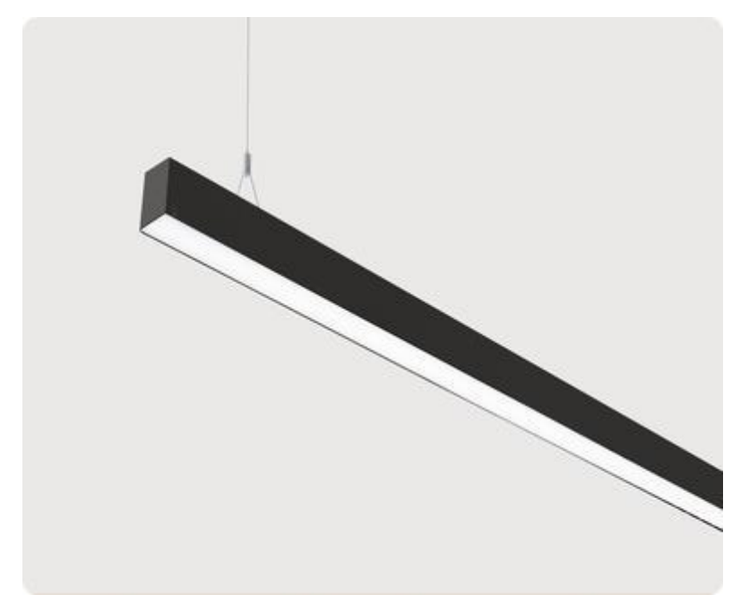
Illustrations may only be similar and serve as an orientation.

Matric-R3. LED. Pendant light-line. Luminaire body made of high-quality aluminum profile. Surface finish Jet Black. Direct/indirect light distribution. Colour temperature: 3000K (Warm White). Colour Rendering Index (CRI): >80. Opal diffuser for enhanced light transmission and perfect uniform illumination. Dimmable DALI. LxWxH (rectangular). L= 1765mm. W=55mm. H=85mm. Y-cord suspension with power supply cable and ceiling rose (Set). Pendant length max 1500mm. Power supply: transparent. Ceiling rose: