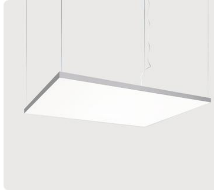
Illustrations may only be similar and serve as an orientation.

Pendant luminaire - Direct light distribution