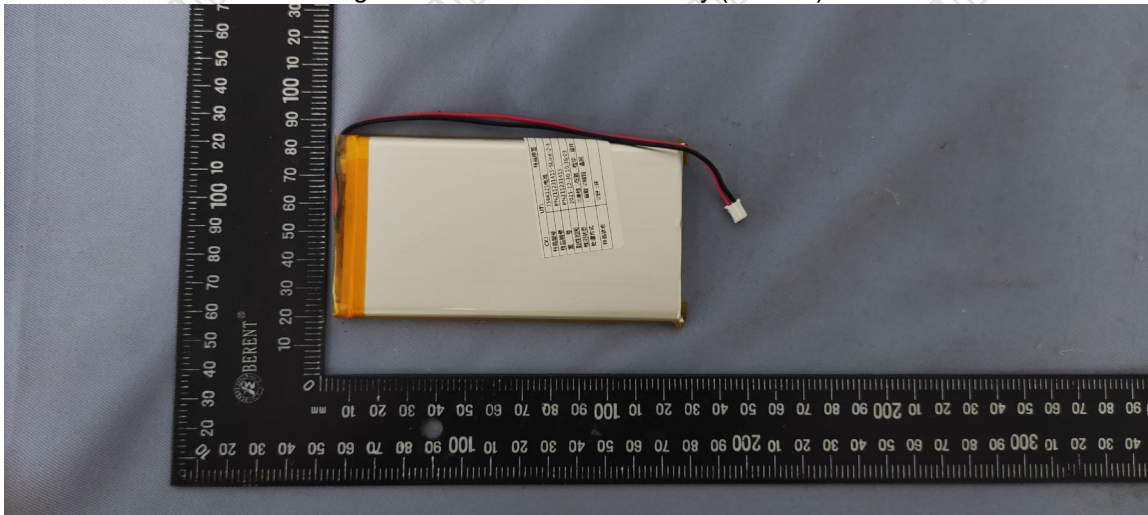
Figure 2 Overall view II of battery (电池图II)